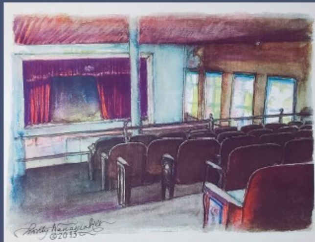
Monty Wanamaker Artwork Courtesy of Southern Museum and Galleries