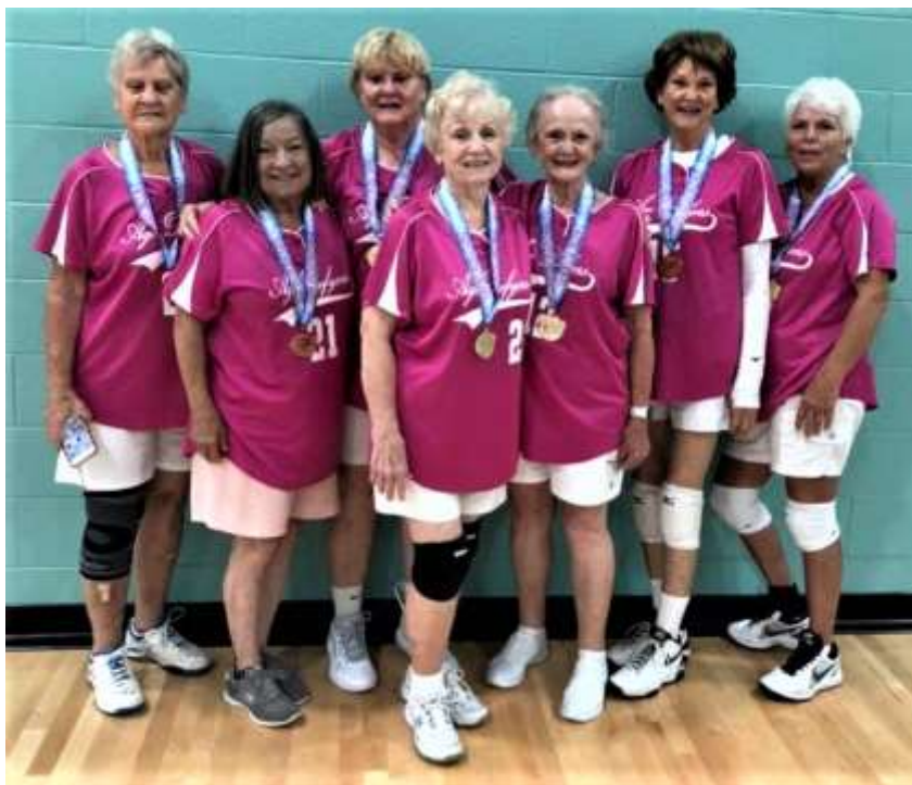
The Age Defyers team