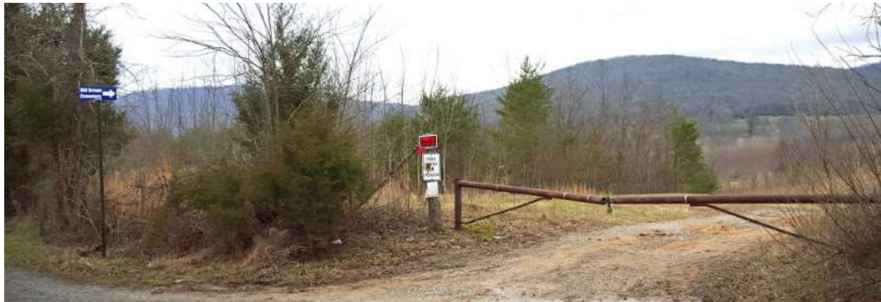
This is a picture of the road sign that we placed to mark the location of the Old Brown Cemetery.

As part of our Cemeteries of Warren County Project, we would like to get road signs placed for as many of our cemeteries as possible. We believe these signs will promote interest in the preservation of our cemeteries and provide a physical reminder of the location of these cemeteries. To reach that goal, the Association will accept donations to purchase and install the signs. Donations may be made to purchase a sign for a specific cemetery or just a general donation to be used for the purchase of signs.